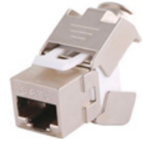
IDKJ6S RJ45 CAT6A 360° SHIELDED SOCKET