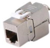
IDKJ6AS RJ45 CAT6A 360° SHIELDED SOCKET